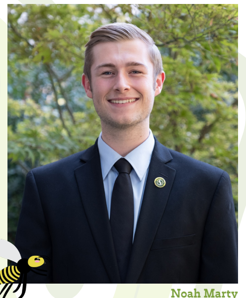
ASI President 2020/21