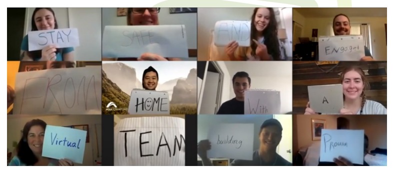
Team Building with the Virtual Challenge Center